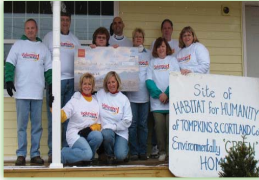
Wells Fargo group-building day.